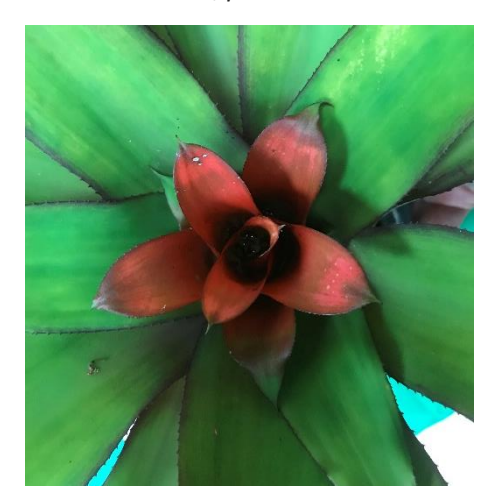
Neoregelia 'Larnach's Enchantment' variegated, Neoregelia 'Skotak's Dorothy' Neoregelia 'Outer Limits'